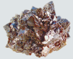
Sphalerite is the primary ore mineral from which most of the world's zinc is produced.

galvanized products remains strong, especially in regions where significant infrastructure projects are being developed. The dramatic increase in the world's production (supply) and consumption (demand) of zinc in the past 35 years reflects demand in the transportation and communications sectors for such things as automobile bodies, highway barriers, and galvanized iron structures.