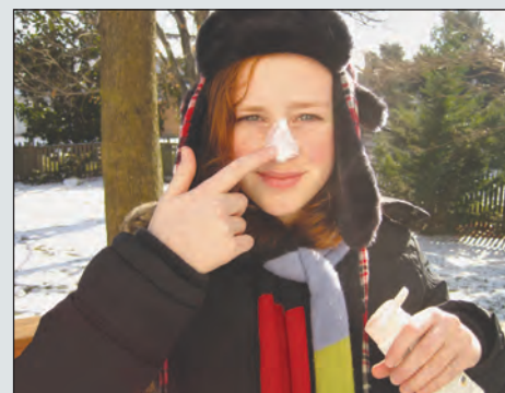
Zinc oxide can protect against sunburn in the summer and windburn in the winter. Zinc is also a key ingredient of healing ointments for wounds and burns.

Zinc is also important for health. It is a necessary element for the proper growth and development of humans, animals, and plants. The adult human body contains between 2 and 3 grams of zinc, which is the amount needed for the body's enzymes and immune system to function properly. It is also important for taste, smell, and to heal wounds. Trace amounts of zinc occur in many foods, such as oysters, beef, and peanuts.