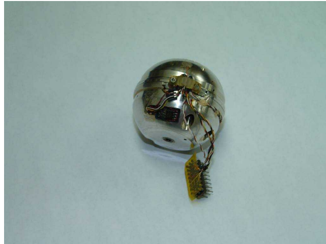
Figure 1: Copper Ball housing the gravity sensor