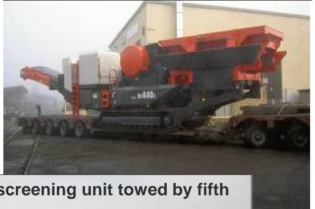
Rubber tire crushing & screening unit towed by fifth wheel