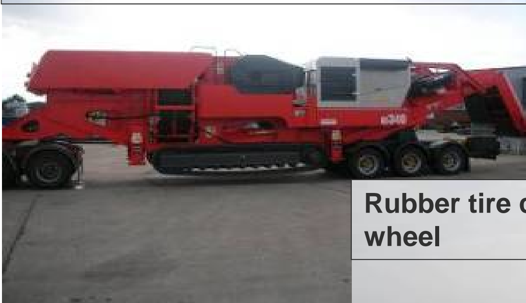
Crusher with bogie