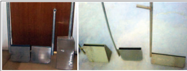
Figure 2. Examples of Cutter Design and Handle Arrangements