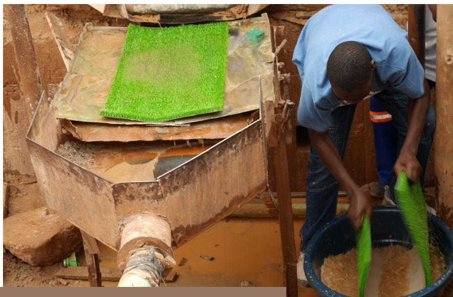
Figure 3 — Sluice box

biomonitoring data. The scope of the project was limited to a short field-based demonstration of the borax method, which was realized by the use of simple methods (observations, discussions, and trial and error).